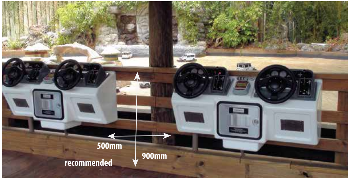
typical console mounting fence

picture opposite shows our consoles installed with customer's own swipe card interface unit instead of normal multi coin mechs