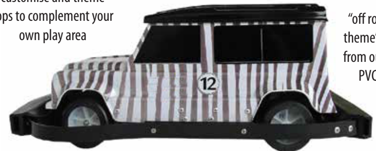
"off road zebra theme" example from our printed PVC range

logos are a great way to customise and theme tops to complement your own play area