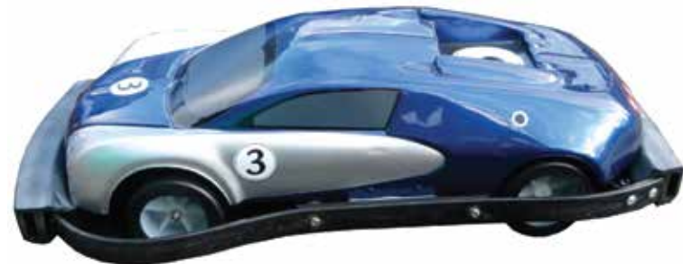
special spray painted example from our sports car body range