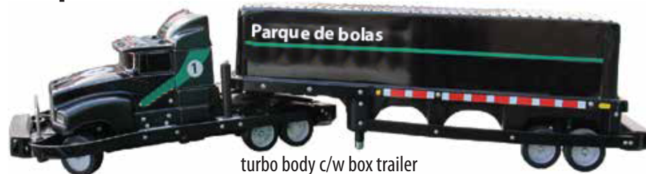
turbo body c/w box trailer