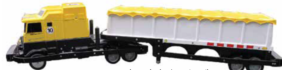
cab over body c/w grain trailer

if unsure please do not hesitate to contact us