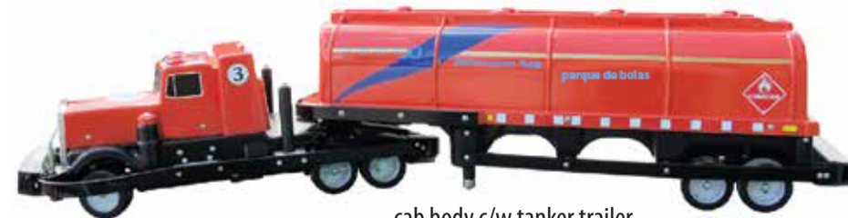
cab body c/w tanker trailer

Spain Telf. +34-986246333 mail to: info@parquedebolas.com whatsapp +34 698 14 94 38