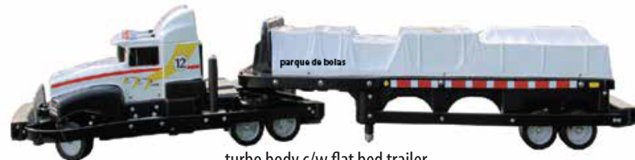
turbo body c/w flat bed trailer