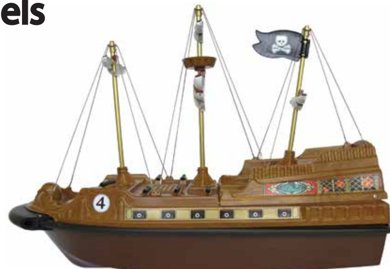
pirate ship c/w woodgrain effect PVC top