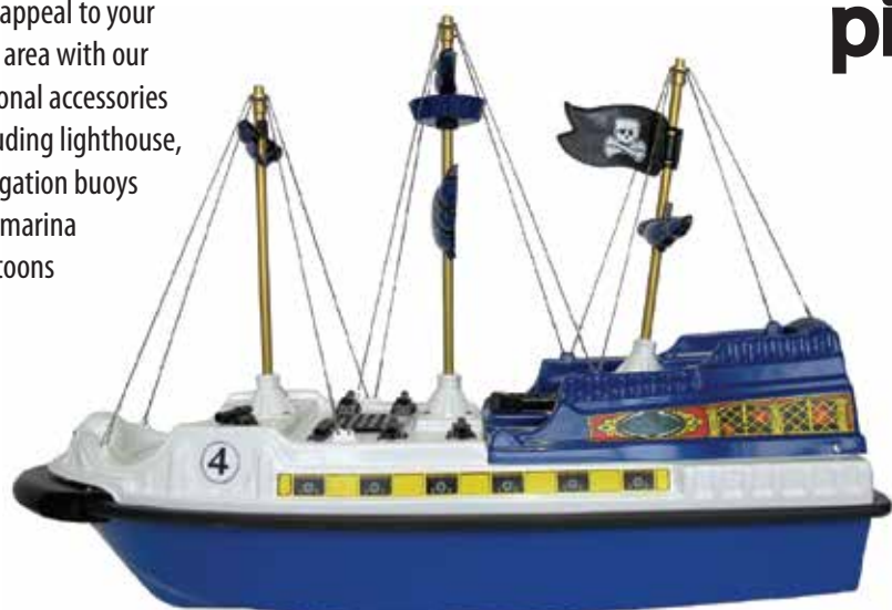
pirate ship c/w coloured PVC top

if unsure please do not hesitate to contact us